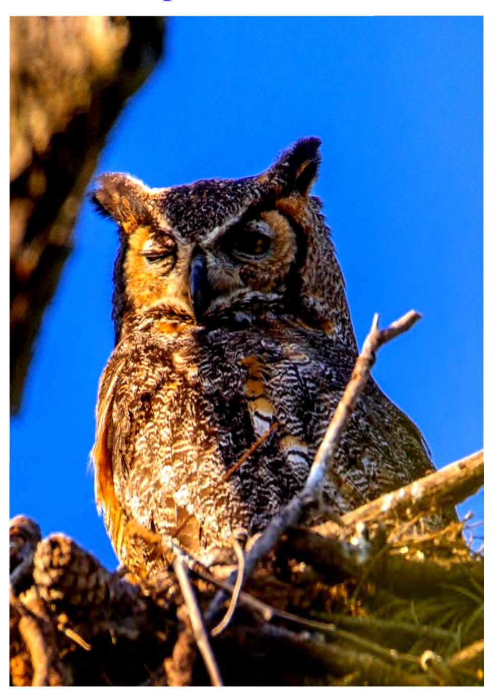
I could do no wrong towards him and he would never do any

The second part of the problem was fantasy, fairy tale fantasy to be precise. I wanted to be loved and really believed that there was a perfect person out there for me who was going to sweep me off my feet and take all my problems away. We were going to be so totally and completely in love that nothing could ever shake us.